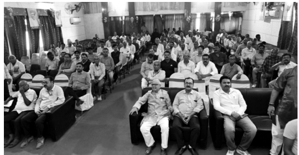
View of audience (2)