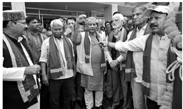
AI president and GS at flag hoisting place