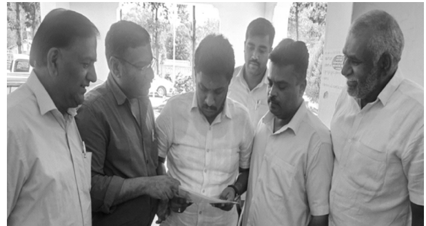
Hasan Comrades submitting memorrandum to Hon'ble M.P

As per the directive of all unions/ associations, Hassan(Karnataka) Comrades submitted a memorandum to Hon'ble MP Shri Shreyas M Patel on 3rd wage revision/PRC to BSNL employees. They requested Hon'ble MP to raise the issue in ensuing Parliament session for settlement of 3rd wage revision/PRC to BSNL employees. Hon'ble MP responded positively on the matter.