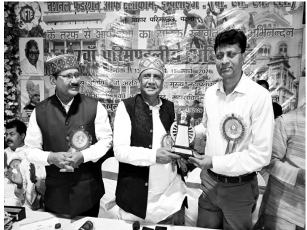
GM (HR) and Com Chaubey addressing the meeting