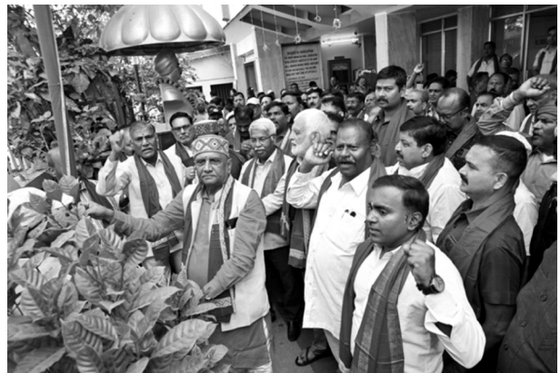
GS hoisting NFTE flag