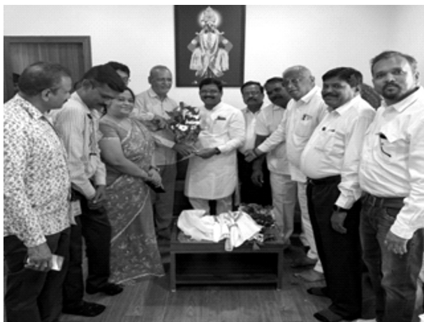
Chatrapur Sambhajinagar Comrades submitting memonrradum to Hon'ble M.P