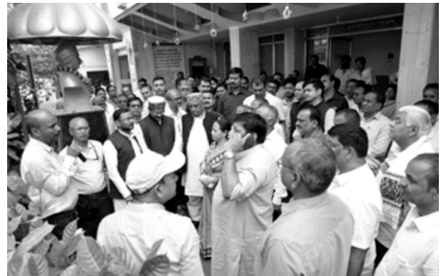
View of gathering at flag hoisting ceremony