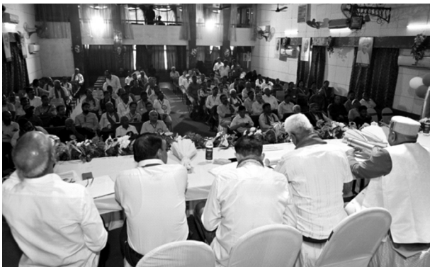
View of the meeting