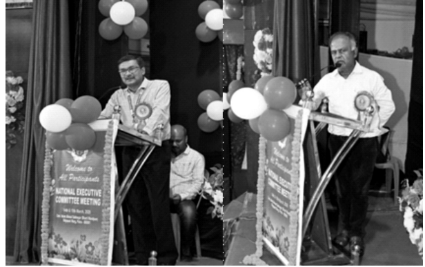
CS honouring CGM with flower boque