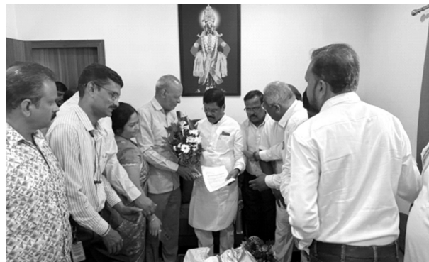
AUAB leaders honouring Hon'ble M.P with flower boque