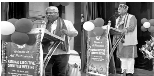
AI president and GS addressing the NEC