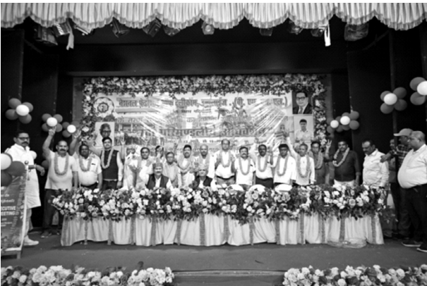
Dias with reception Committee members