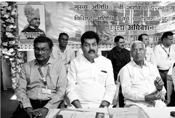
View of dias