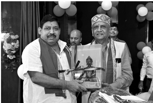
CS honouring GS with memento