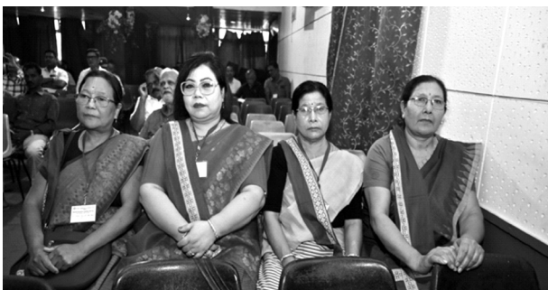
View of Comrades from manipur