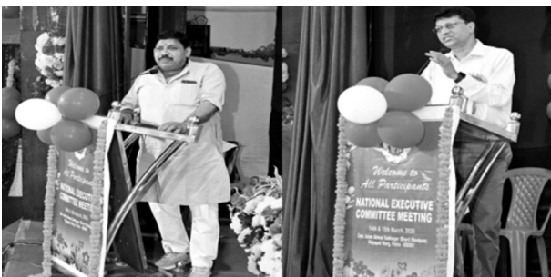
CS and CGM addressing the meeting