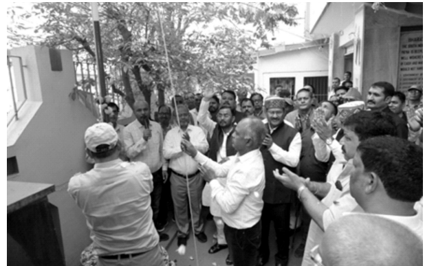
Flag hoisting ceremony (2)