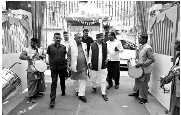
GS arriving to NEC