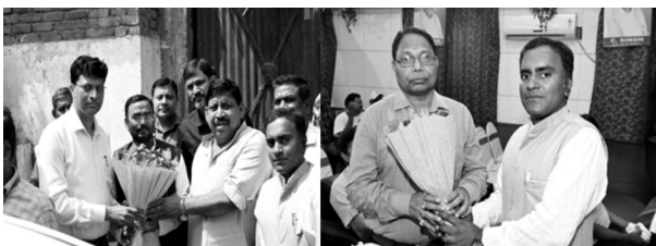
CS welcoming CGM with flower boque, Com Divya Jyothi honouring GM (F) with flower boque