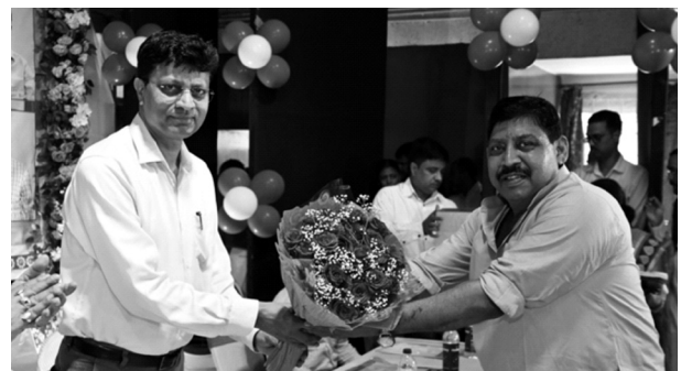
CS honouring CGM with flower boque