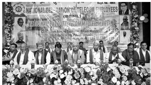
View of dias