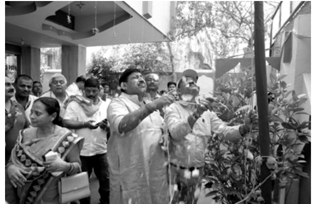
Flag hoisting ceremony (1)