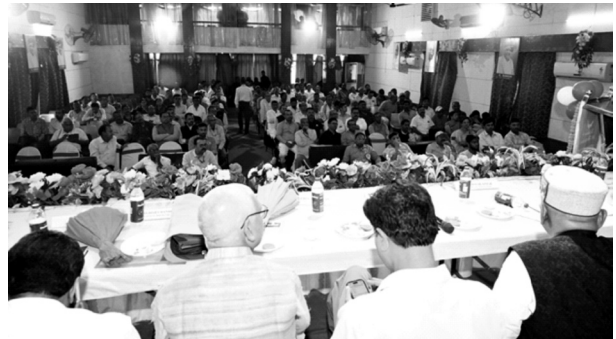
View of audience (1)