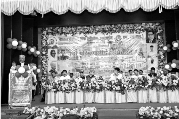
View of dias -GS addressing